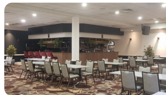
JOE KIERNAN ROOM - SEATS 150