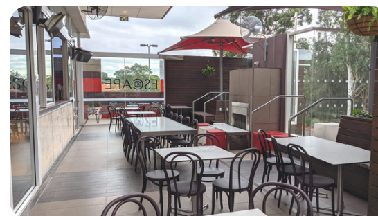
ESCAPE OUTDOOR - SEATS 50