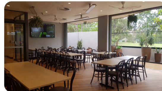
ALFRESCO BISTRO FUNCTION AREA - SEATS 50